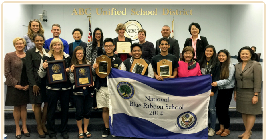
The Board of Education recognizes Whitney HS in being selected a 2014 National Blue Ribbon School.