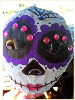
Paper Mache Calavera Mask