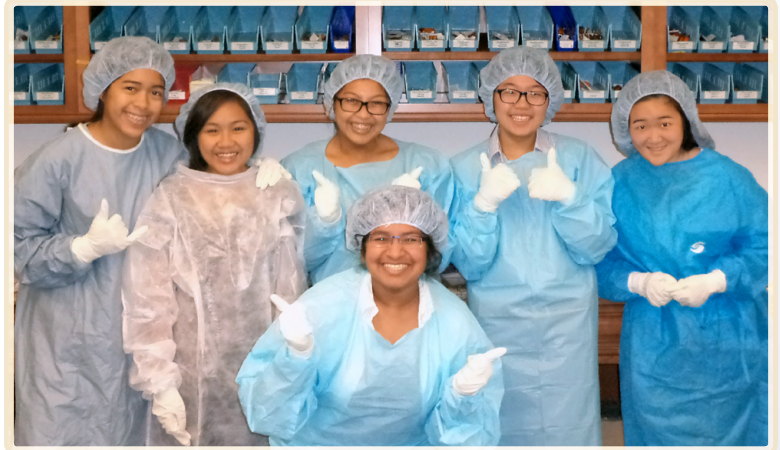
Pharmacy students from Cerritos High School

In 2013-2014 school year, SEROP served approximately 10,000 high school students (4,683 unduplicated) between ABC and NLM school districts, and currently has 75 classes/sections on the high school campuses in ABC. Especially with the implementation of Common Core, SEROP plays an important role in supporting students to be college/career ready and is an invaluable resource to the District. SEROP offers many career-technical education courses that are University of California (UC) approved. Last year 36 ABC high school students earned their Pharmacy Technician License from the State of California, and 10 students are enrolled in a direct entry Pharmacy College/University. Many of the Pharmacy students are also enrolled in nursing programs at various colleges.