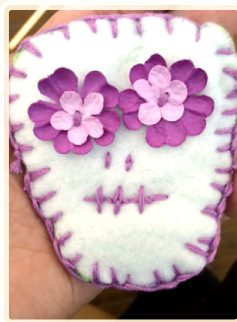
Felt Calavera Pin

The theme for this month was, “El Dia de Los Muertos,” or Day of the Dead. First celebrated in Mexico, El Dia de los Muertos is now celebrated in many other countries. It is a day dedicated to joyous celebrations honoring the memory of those who have passed. Typically, festivities include decorating or painting one’s face to depict an elaborately colored “calavera,” or skull; the iconic symbol associated to El Dia de los Muertos. Among other joyous activities, festivities include, festively decorating grave sites and preparing favorite foods of those who have passed are also common practice. ▶