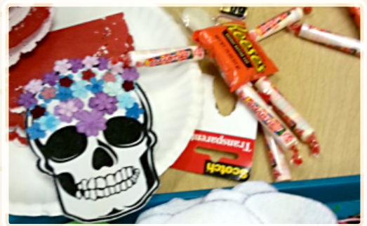
Decorate your own Calavera (left) and Create your own Candy Skeleton Game (right)

On Friday, October 24, 2014, teachers of the Extended Day Program (E.D.P.) collaborated for a district wide “Curriculum Share”. For this “Curriculum Share” event, teachers at various schools came together to share crafting ideas and activities for a specific theme based on literature.